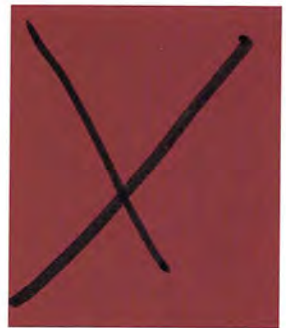
807 BRICK RED D