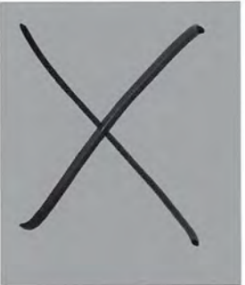
818 SILVER SPUR W