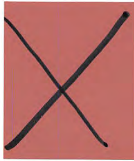
831 ROSELLE W