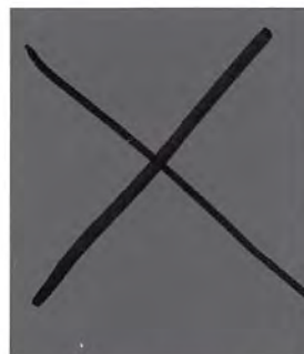
852 GUN METAL D