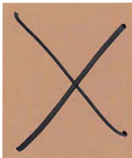
817 HARVEST WHEAT W