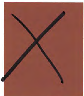
833 CORONADO D