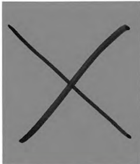
801 NATURAL SLATE W