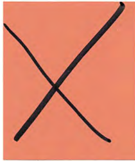
841 NUEVO TERRA W