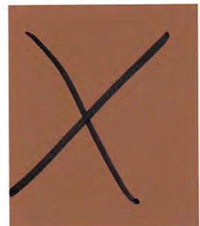
835 SADDLEBACK D