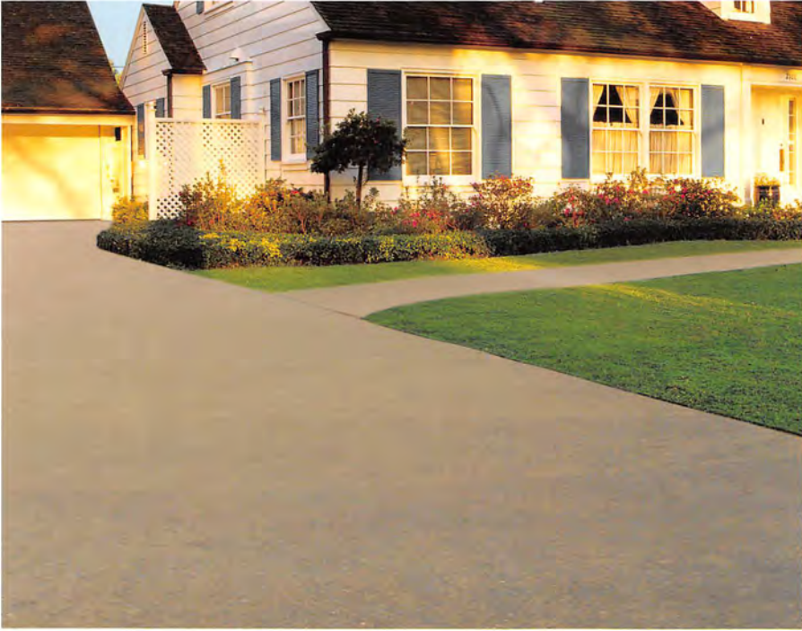
Driveway & Walkway: 816 Fawn