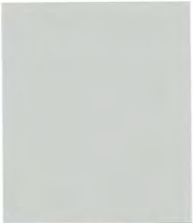
815 PACIFIC FOG W