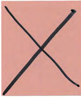
820 CORAL REEF W