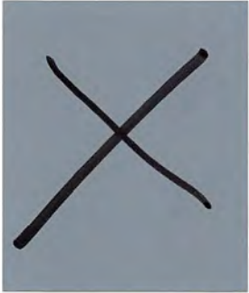
814 BRAZIL MARBLE W