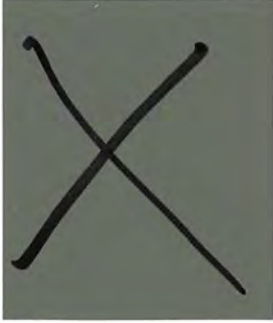
808 FOREST GREEN D