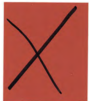
842 FIRETHORN D