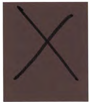
809 CHESTNUT BROWN D

Computerized color match to nearly any color!