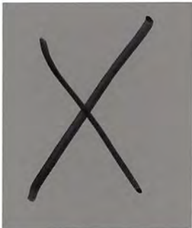
838 TAUPE GRAY W