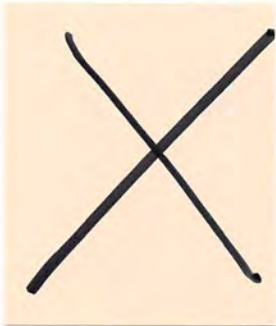
839 PEACH WHITE W