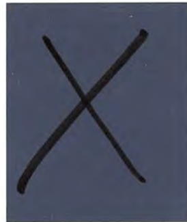
851 NEW GALAXY D