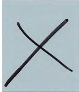
810 GLACIER BLUE W