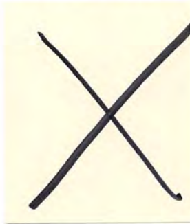
832 TANSTONE W