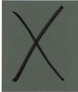
844 PARK GREEN D