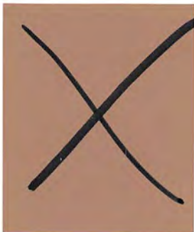
822 BERMUDA TAN W