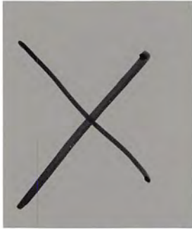
806 PEBBLE GRAY W