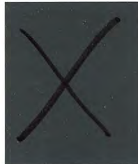
848 VERDE TEAL D